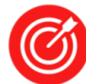
Marketing Services & Intelligence